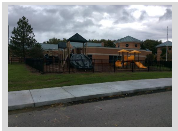
New Fence at Kindergarten Playground