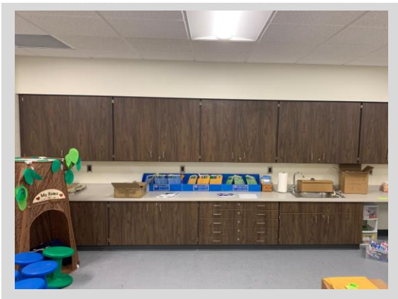
New Casework in Classroom Addition