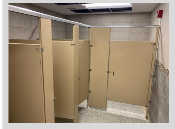
New Women's Restroom Renovation