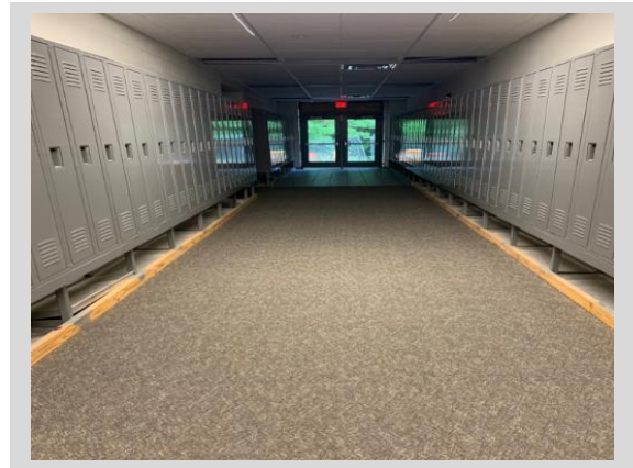
East Addition Corridor and Lockers